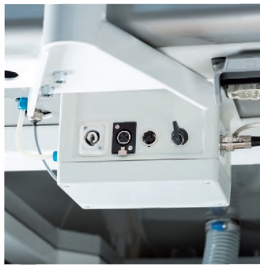
Secured decontamination hardware