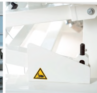
Level adjustment system