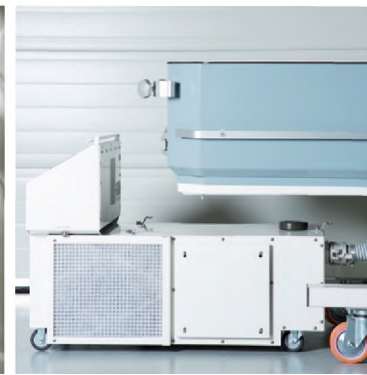
Detachable control unit