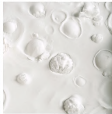
Fluidisation in progress