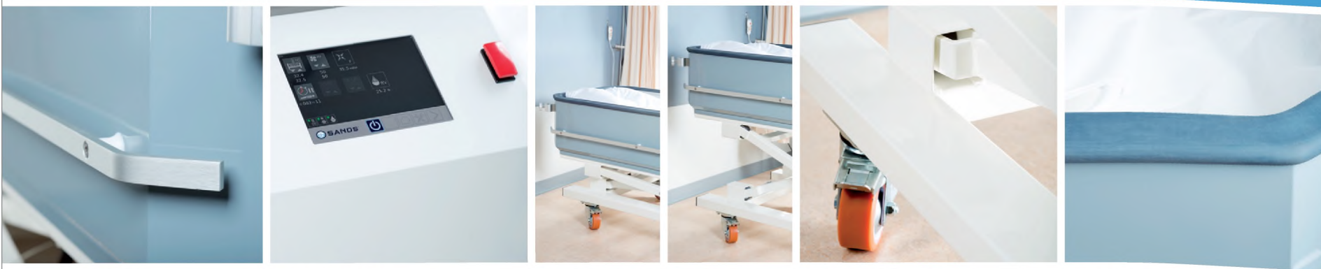
Safety side rail

An appealing timeless colour setting and sturdy system design.